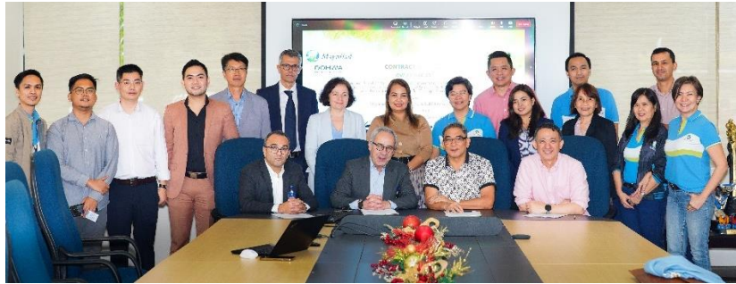
SUEZ signs contract for wastewater treatment project with Maynilad to clean Manila Bay.